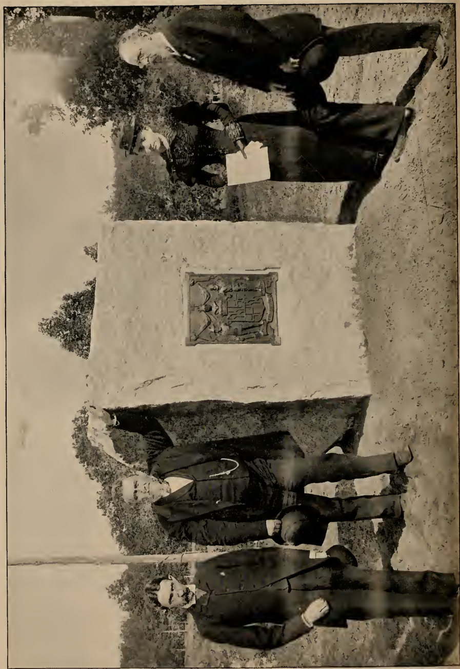
MONUMENT TO THE MARYLAND LINE ON GUILFORD BATTLE-FIELD,