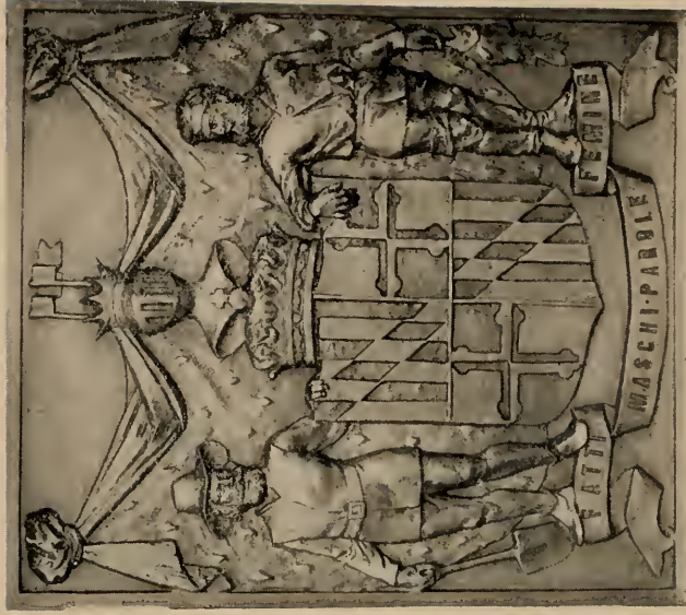
BRONZE TABLETS OF THE MARYLAND MONUMENT.